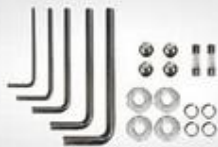
Wrench & Screw